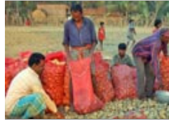
Farmers sorting potatoes at a field in Nadia