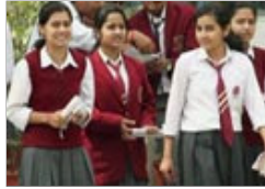
Students at a centre in Meerut as board exams begin