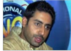
Abhisekh Bachchan at a press conference in Amritsar