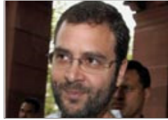
Rahul Gandhi at the Parliament House in New Delhi