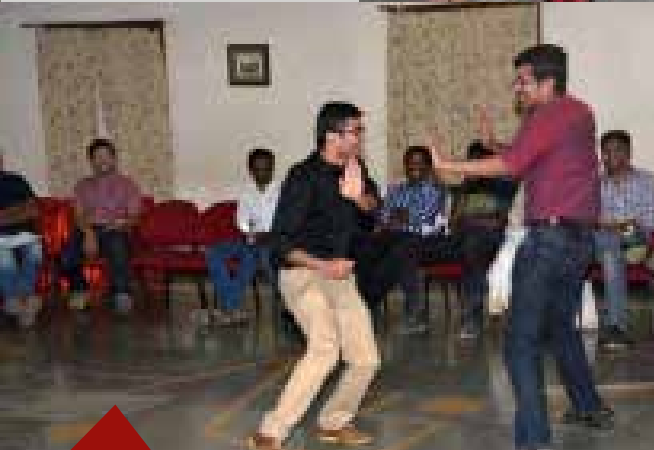
Coimbatore Chapter Meet February 2015