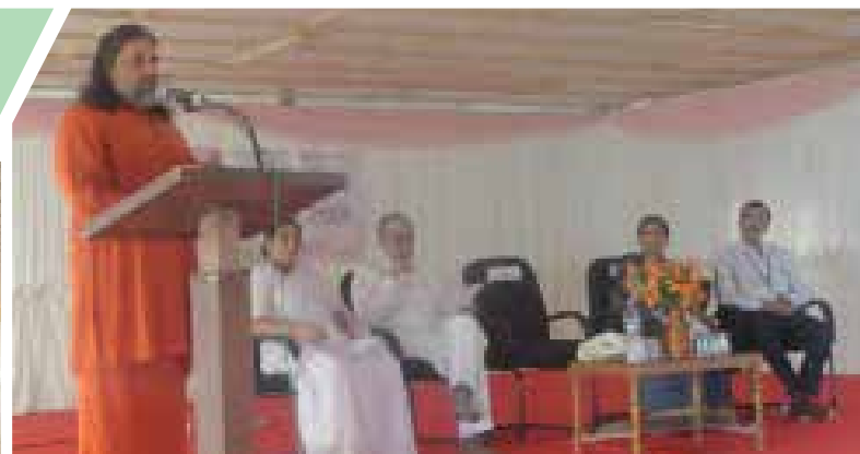
Alumni reunion along with the 10 th Anniversary celebrations of the college