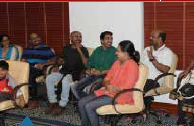
Dubai Chapter Meet January 2015