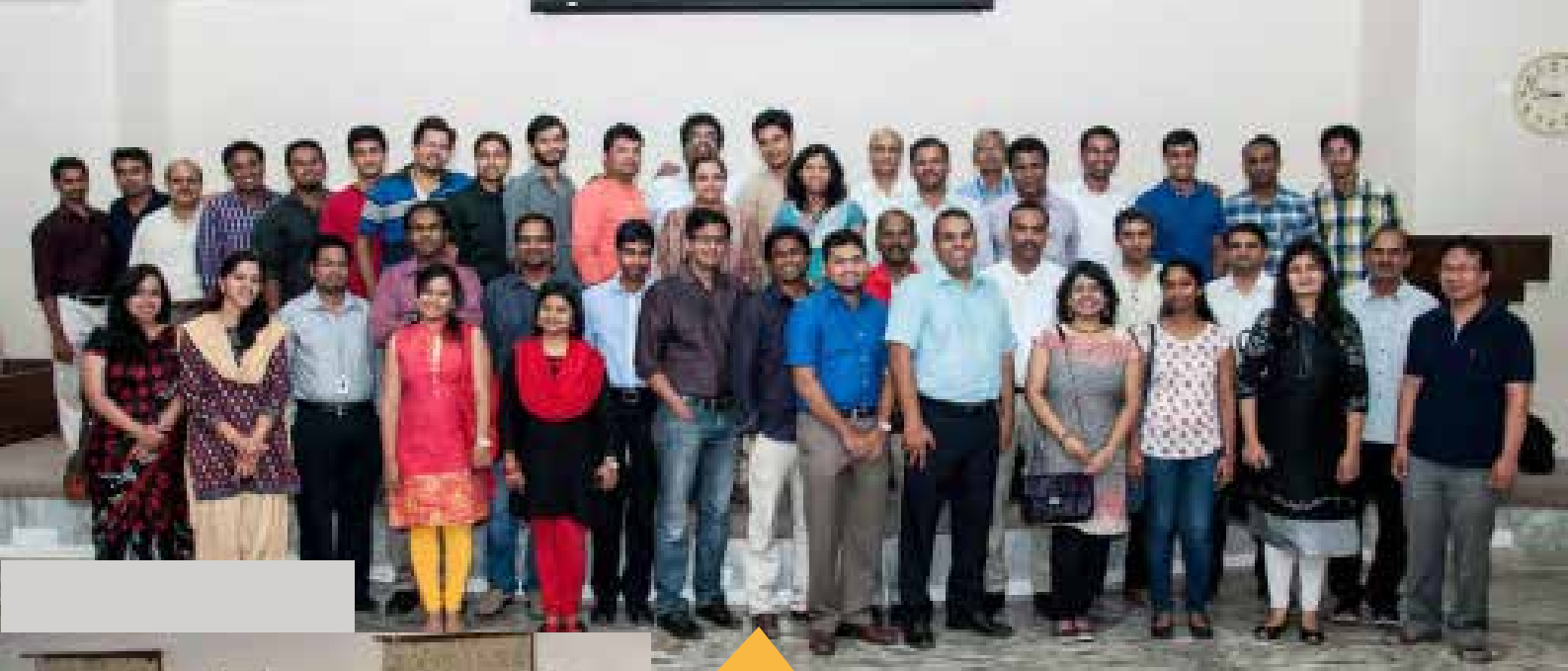
Bangalore Chapter Meet May 2015