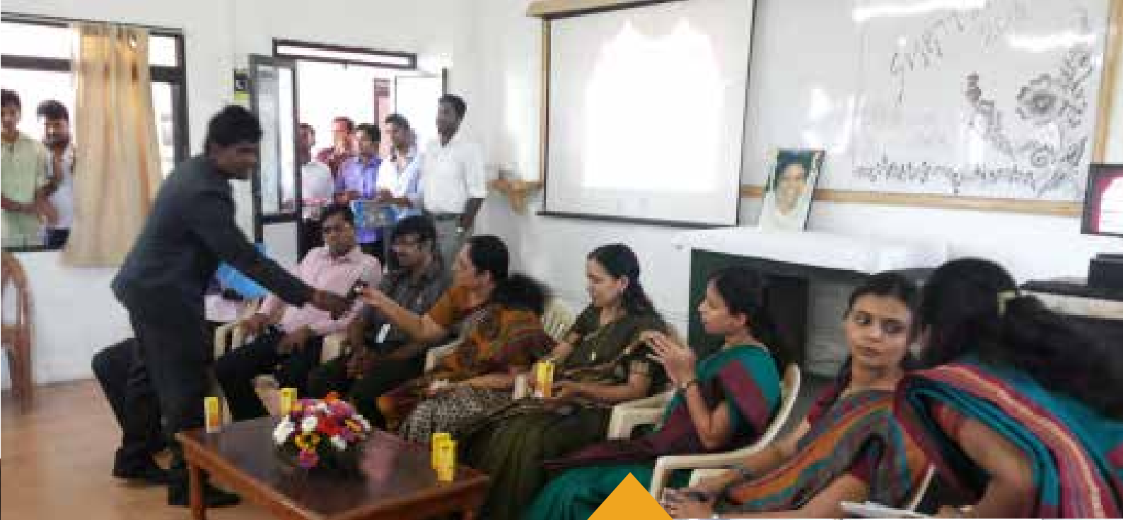
Alumni Meet 2013