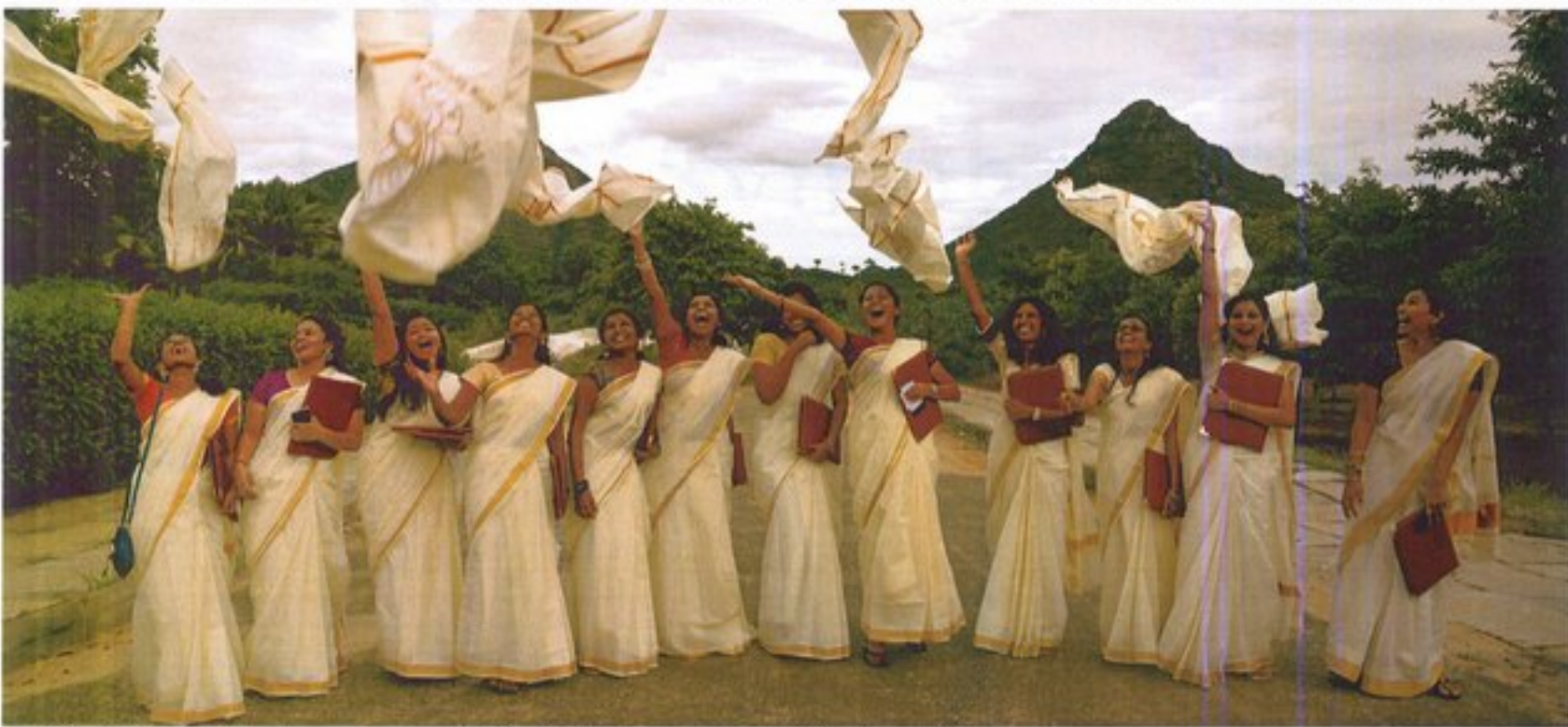
Road Ahead: Students are seen ecstatic after their convocation