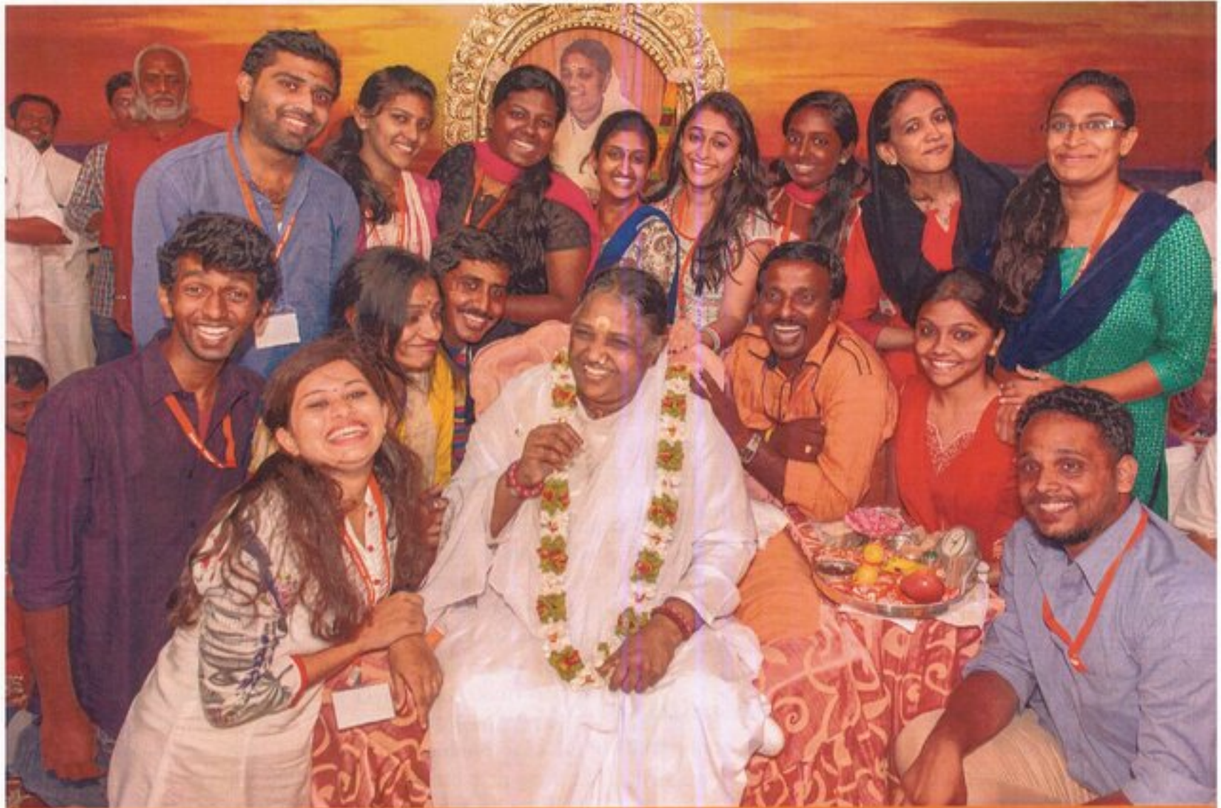
A rare photo opportunity with Satguru Sri Mata Amritanandamayi Devi, spiritual guide to millions and Chancellor of our university, The beaming ones are the first year MA students of Amrita School of Communication and the faculties who accompanied them. The trip to her ashram in Amritapuri was a memorable one for the students.

Lets hope this trend continues for a long time.