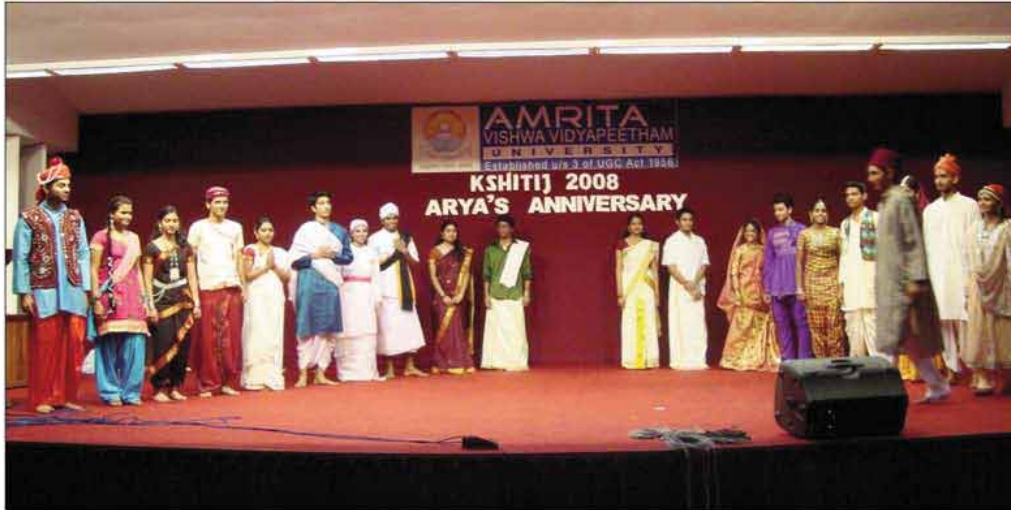
First ever costume show in Amrita University

Monday, November 17, 2008 Ettimadai, Coimbatore - 641 105, email:journalism@amrita.edu, Ph: 91422-2656422, www.amrita.edu