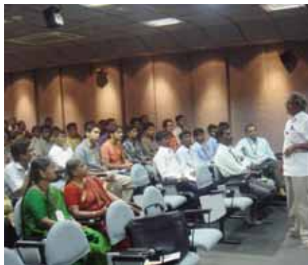
guest lectures and presentations were going on....

"The idea of doing something for the students, sharing something with them... which also allows them to contribute,