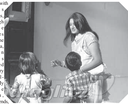
A still from Apoorva