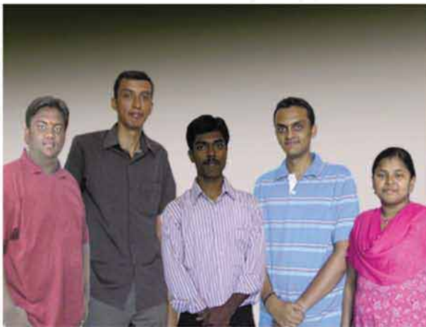
Founders of TESLA

Now they have re-structured their software by considering suggestions provided to them and made the interface more user friendly so that even a child can learn signs easily. The students have therefore created a platform for the less privileged.