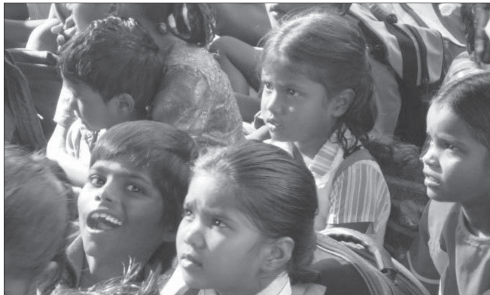
Eagerly looking forward to a bright future...children attending the classes conducted by Amrita students