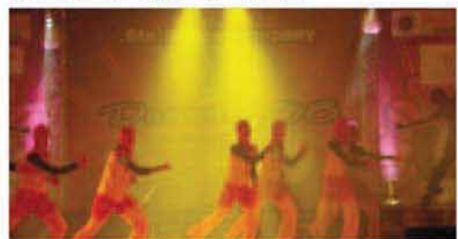
Stepping Legends on the move

They also do show for inter school and college functions. The whole dance program was a feast to watch.