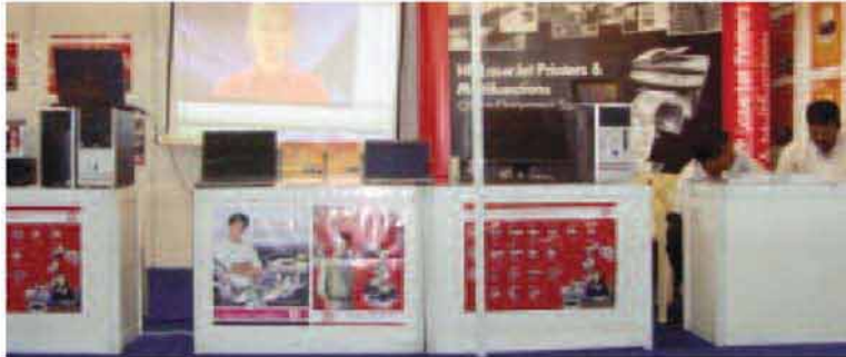
A computer accessories stall by HP Macro at the expo

Institutions: Solutions & Strategies'. Lenovo, HP, HTL, introduced their IT products with cool expo is a good platform to introduce their product