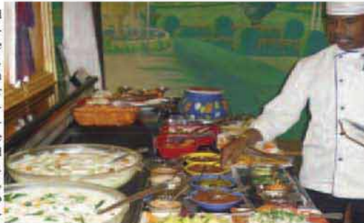
A Chef at work in the Punjabi food festival