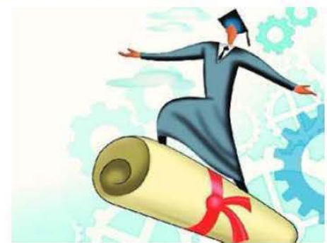
This time round, India has 27 universities in the top 300. Last year, 16 Indian universities had made it to the top 200. China continues to dominate with 52 places in the top 300 and six in the top 10.

MUMBAI: India is the second most represented country in the newly expanded Times Higher Education BRICS and Emerging Economies University Rankings , with the Indian Institute of Science (IISc) becoming the first Indian institute to break into the top 15.