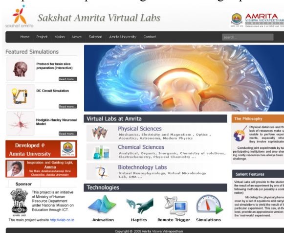
Figure 1. Sakshat Amrita virtual labs.

Setting and developing AMRITA virtual labs (see Figure 1) as a complete learning experience has not been an easy task. Amongst the major challenges we faced included usage/design scalability, deliverability efficiency, network connectivity issues, security and speed of adaptability to incorporate and update changes into existing experiments.