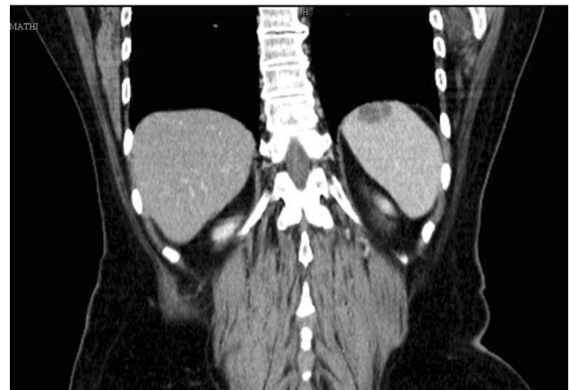
Fig. 2 CT scan abdomen showing a 2.1 \times 2.4 cm hyperdense lesion in splenic parenchyma (coronal view)

[4, 5]. Splenic metastases usually take place in the context of multi-visceral disseminated disease. However, due to the improvement of imaging techniques and the increasing number of long-term survivors with cancer, the number of cases of isolated splenic metastasis has been increased [5].